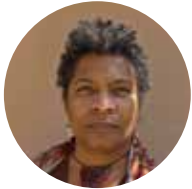
NALO HOPKINSON Professor of Creative Writing

Won a Comic-Con Inkpot Award for her contributions to science fiction, including creating "House of Whispers," part of Neil Gaiman's "The Sandman Universe."