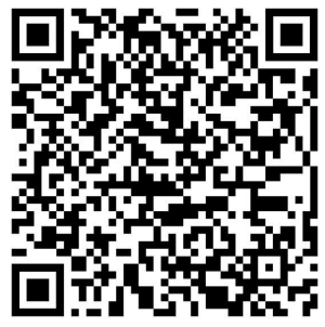
FAQ from CareerEco

Use a QR code reader -or- cell phone camera to open these QR Codes