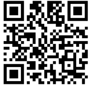
Virtual Event Tutorial Video